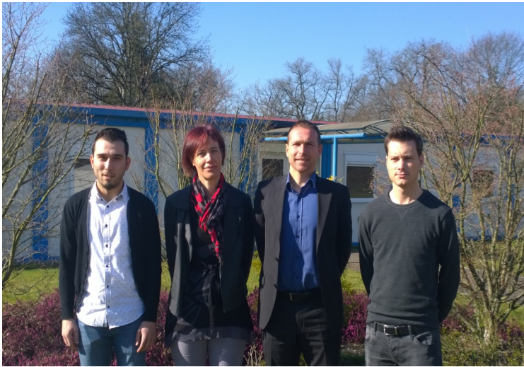
The Eurocooler SAS Sales Team